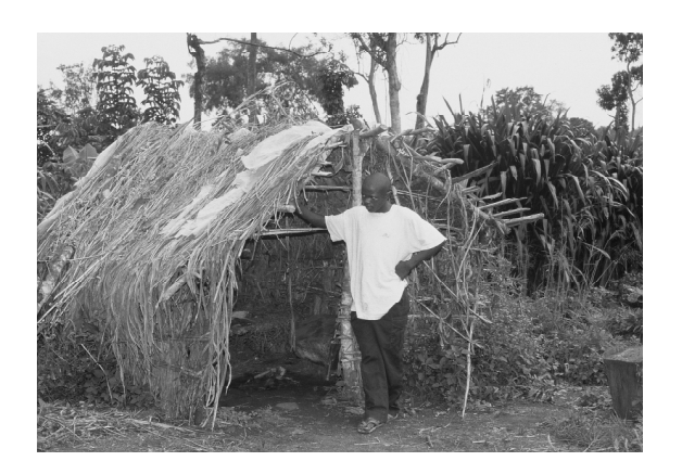
Too many people for too few houses: makeshift shelters.

In November 2001 Kaweri supported the humanitarian aid by the Kayinda-Mityana Diocese with a donation of the equivalent of 2,000 Euros. They also financed the construction of the new school with 16,000 Euros to compensate for the school they took over and are now using as headquarters. Moreover, they turned to the organisation Habitat International to cooperate with them on improving the IDPs living situation. But the planned training programme has not begun