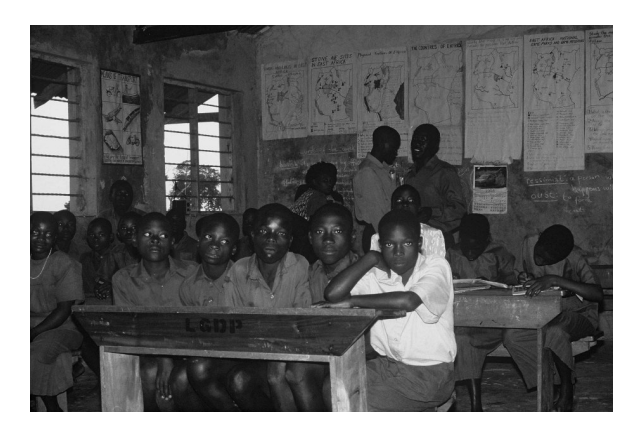
The new school: A lost year. No graduation.

Schooling has been massively disturbed as well. The children were deprived of a school for one year because it took this long to construct a new building, and during this time, about one third of them decided to quit school altogether. Moreover, the new building's quality is vastly inferior to that of the old one, and due to its smaller size, the school is only able to accommodate five grade levels instead of the previous seven, so that the children are no longer able to graduate there.<sup>22</sup>