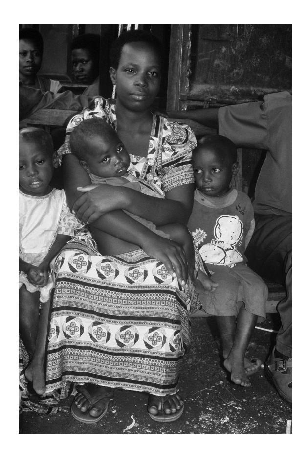
"Previously we had everything, today my children are crying."

Furthermore, it was the Kaweri Plantation itself that made these people dependent on wages in the first place. Prior to the eviction they were able to work independently and had earnings that were significantly higher than the wages they receive now. The study commissioned by Action Aid has determined that there has been a significant reduction of most people's monthly income.<sup>26</sup> "The plantation is claimed to have brought development.