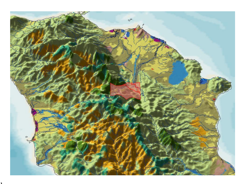
Figure 3: Topographical map showing river systems and location of the Mindoro Nickel Project on a watershed

A range of environmental risks is associated with the process plant and RSF. Nickel metal and cobalt salt, the by-products ammonium sulphate (fertiliser), metallurgical grade chromite and minor amounts of zinc sulphide will be produced at the processing site.156 Intex plans to construct a fuel/oil depot, a storage area for chemicals and reagents, a power station, hydrometallurgical process facilities, workshops, an administration building, warehouse, personnel housing, a mess hall, a laboratory and heavy equipment shops. 157 Potential risks include reduced water or water quality, air pollution, accidental waste discharge, and traffic accidents. Health hazards include noise/dust pollution and