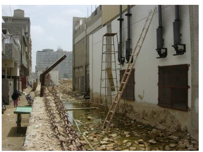
ARE THESE PICTURES OF A SLUM AREA----?