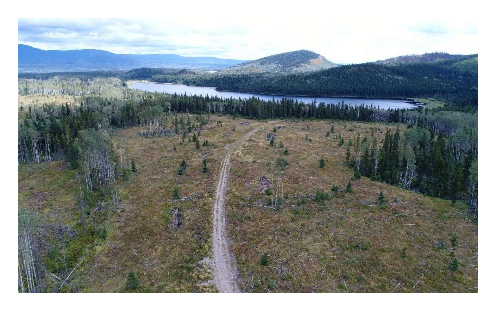
Photo 4: Pinnacle cut-blocks near Burns Lake, British Columbia, 28 August 2021