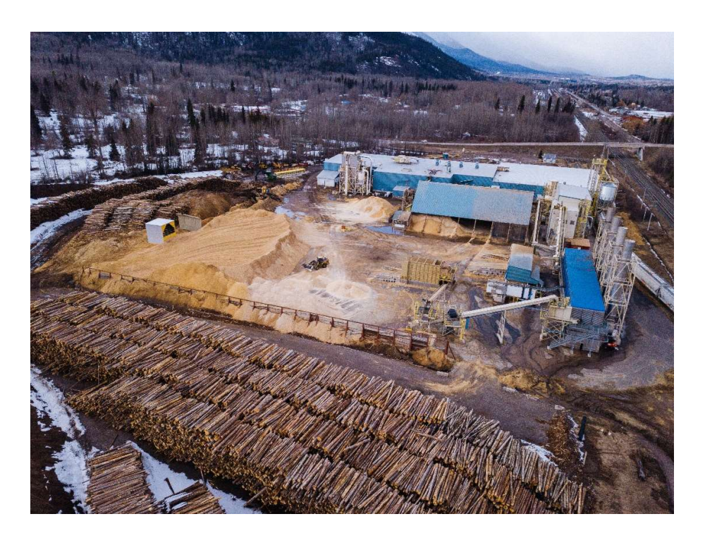
Photo 2: This photo was taken at Pinnacle's pellet manufacturing facility in Smithers in March 2021, showing whole trees stock-piled for pellet manufacture