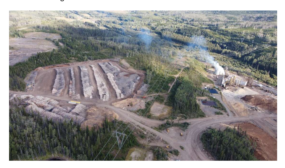
Photo 1: This photo was taken at Pinnacle's Burns Lake pellet manufacturing facility on 29 August 2021, showing whole trees stockpiled for pellet manufacture