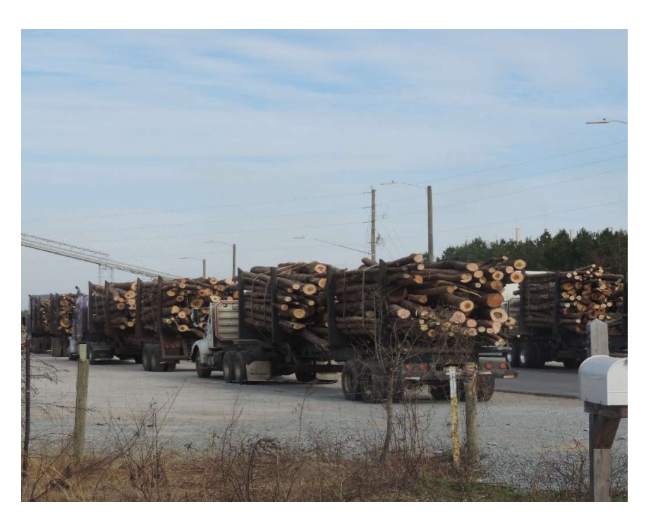
Photo 5: logging trucks carrying large diamenter trees from a clear cut site in Sampson County, lined up waiting to enter Enviva's Sampson County pellet-manufacturing facility, February 2017