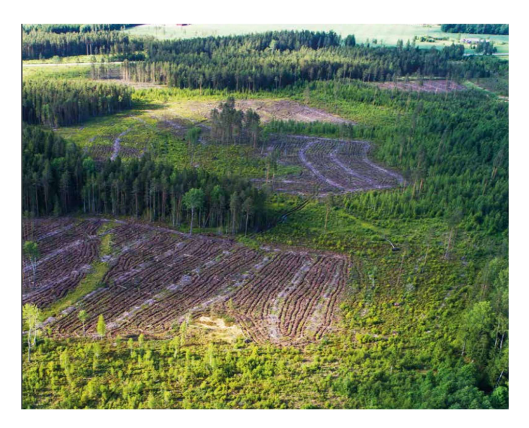
Photo 8: Clearcut logging sites in state-owned forests in Estonia