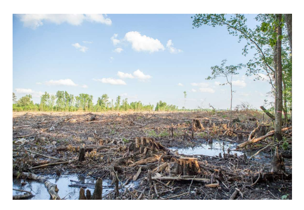
Photo 7: A clearcut site in Potocasi Creek, which is a wetland and bottomland forested area near Woodland, North Carolina, 2015. The logging trucks carrying whole hardwood trees from this site were tracked back to the Enviva pelleting manufacturing facilities in Southampton and Ahoskie.

13.11 Drax also obtains wood pellets from Graanul Invest in Estonia. A report by Estonian NGOs Estonian Fund for Nature and Latvian Ornithological Society notes that there are "numerous examples of Valga Puu [a subsidiary of Graanul Invest] clearcutting forests on Natura 2000 sites, mostly in the Haanja and Otepää Nature Parks." This report includes a number of pictures evidencing what clearcutting looks like on the ground, including picture 8 below (see also picture 9):