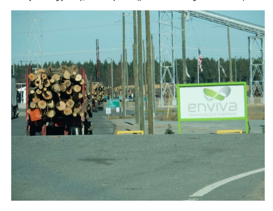
Photo 6: logging truck carrying large diamenter trees from a clear cut site in Sampson County, entering Enviva's Sampson County pellet-manufacturing facility, February 2017