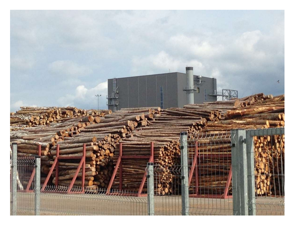
Photo 9: Log yard and plant at Osula Graanul Invest pellet mill in Sömerpalu, Võru County, Estonia, July 2019 showing whole trees ready for pellet manufacture.