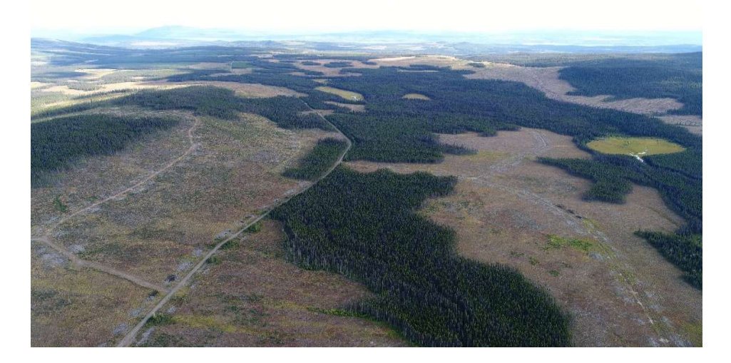
Photo 3: Pinnacle cut-blocks near Burns Lake, British Columbia, 28 August 2021